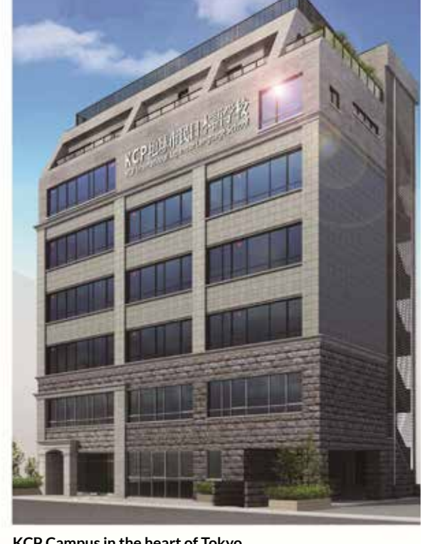
KCP Campus in the heart of Tokyo

I expected to be able to hold basic conversations in Japanese by the end of the program, but I was actually surprised. I became able to participate in quite complex conversations with most of my Japanese friends.